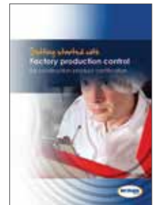
Getting started with Factory production control for construction product certification