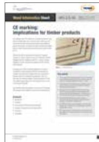
Wood Information Sheet 2/3-56 CE marking: Implications for timber products